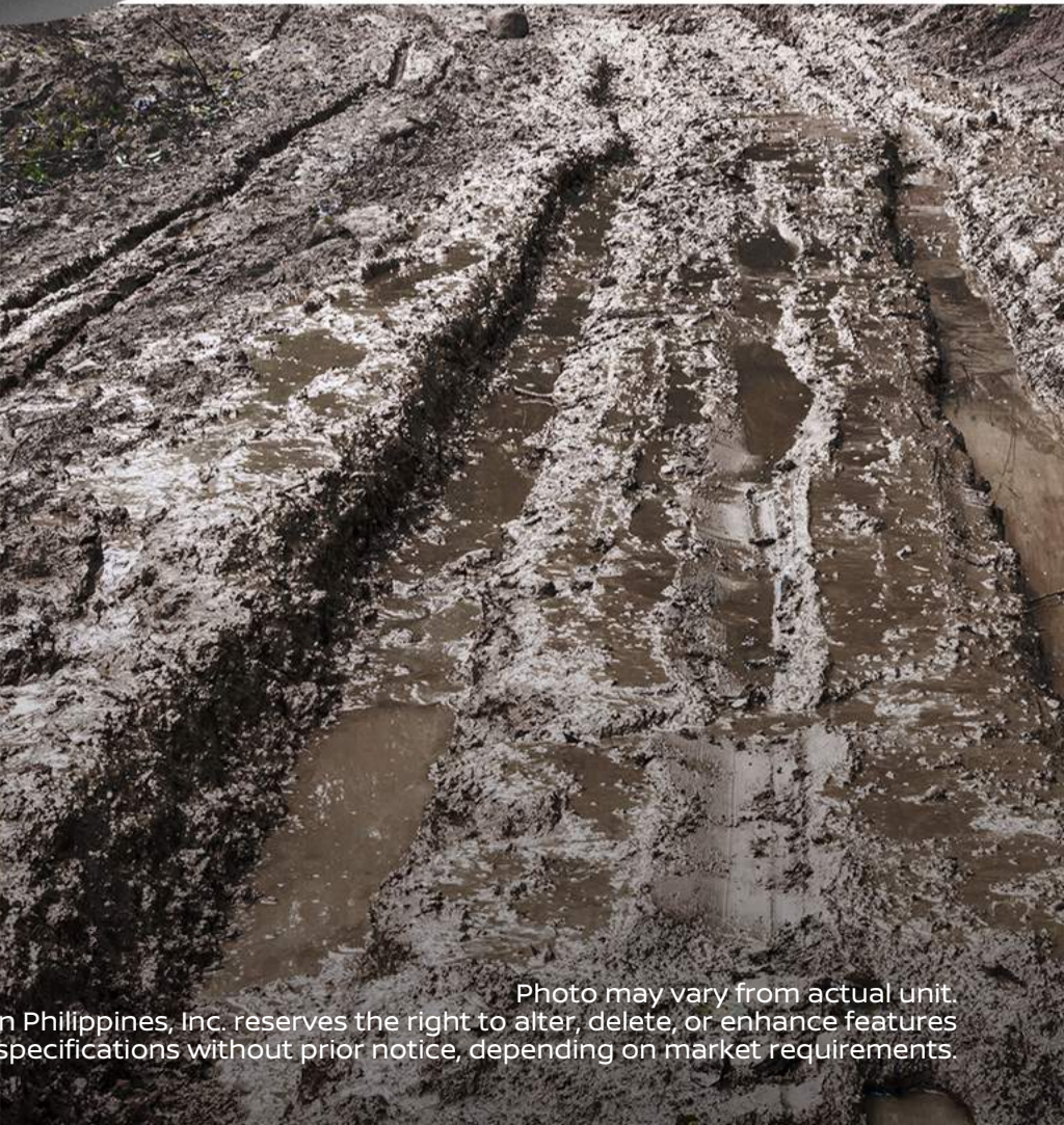
Photo may vary from actual unit. Nissan Philippines, Inc. reserves the right to alter, delete, or enhance features and specifications without prior notice, depending on market requirements.